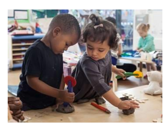
'Parents' views of their child and their needs may be different to that of the Practitioner / Professional'

'Children have a sense of being valued and respected when they are listened to'