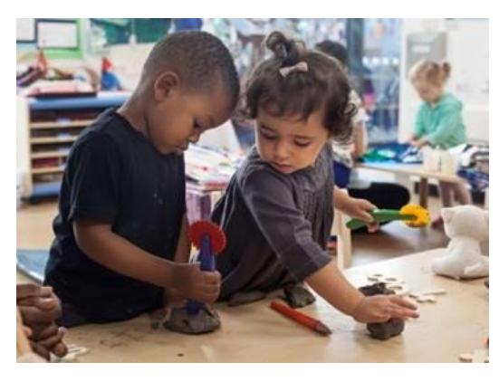
'Parents' views of their child and their needs may be different to that of the Practitioner / Professional'

'Children have a sense of being valued and respected when they are listened to'