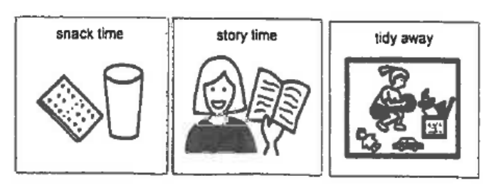
Defined session times

Giving the nursery sessions defined times with labels, pictures or symbols is also useful. Snack time, tidy up time or circle time will again provide more security.