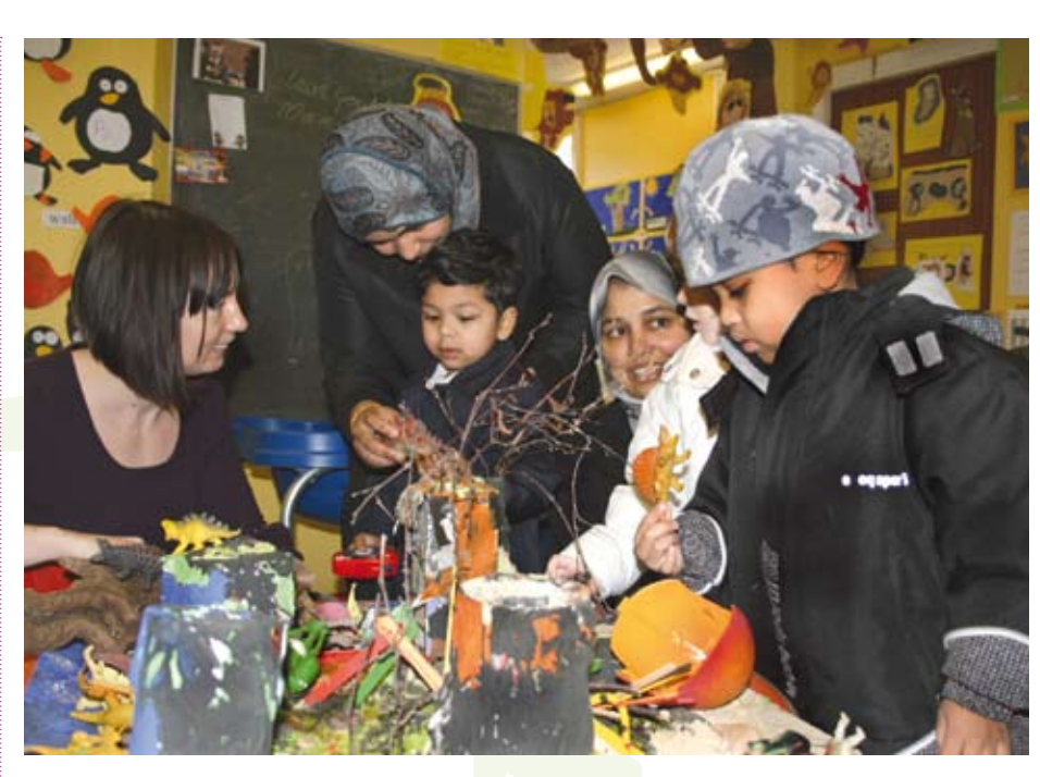
Take time to talk when parents drop off or pick up their children

Try to plan opportunities for parents to meet practitioners regularly on a one to one basis throughout the year, including home visits if appropriate.