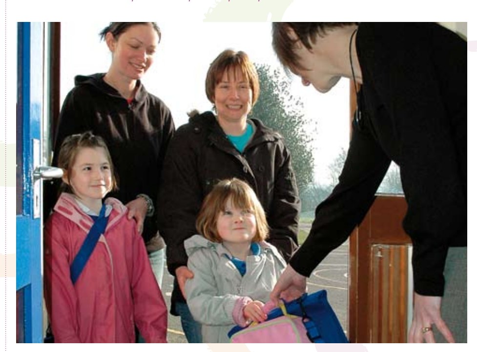
New rooms, new routines